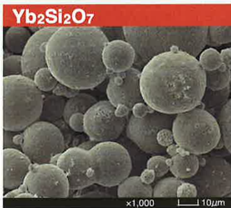
Particle Size Distribution