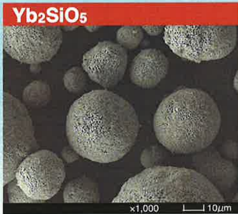
Particle Size Distribution