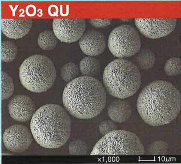
Particle Size Distribution